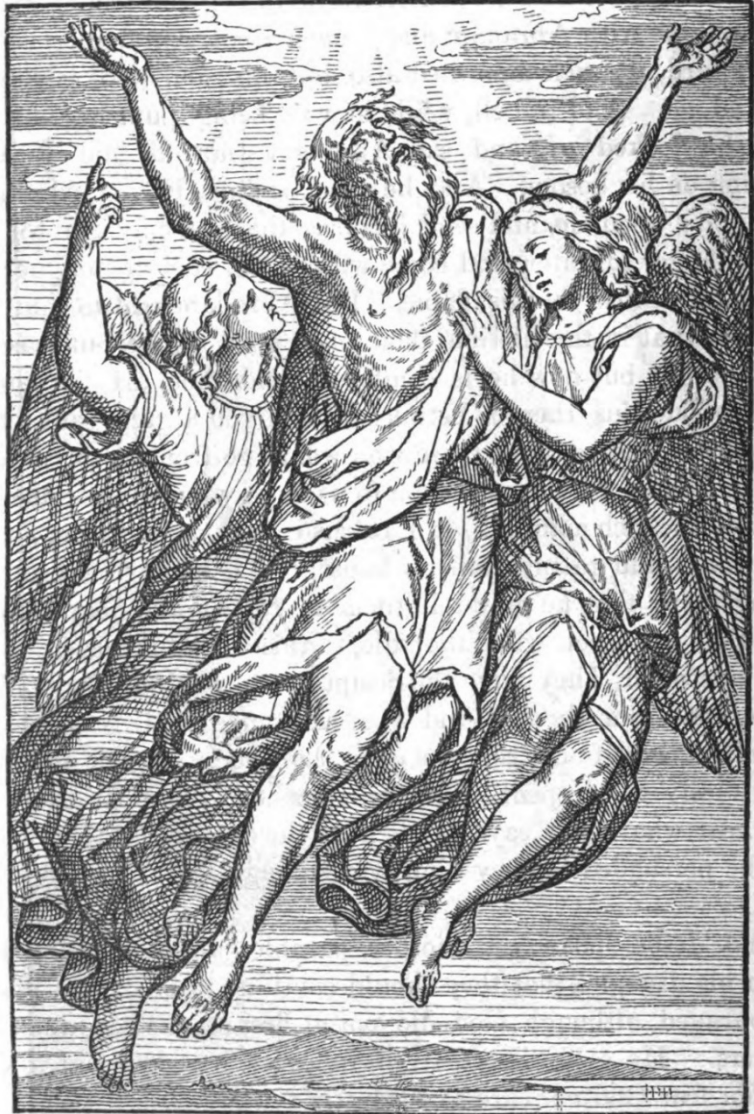
Lazarus Carried by the Angels to Heaven. Public domain. Artist unknown, 1873